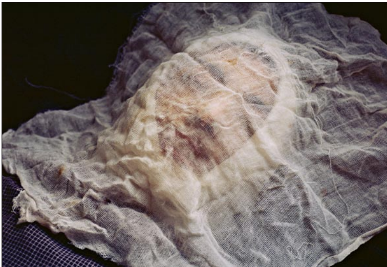
A Young Burn Patient in Herat, Afghanistan, 2005.

Self-immolation is the act of burning oneself as a means of suicide. Although reliable data on the scope of this practice are difficult to obtain in Afghanistan